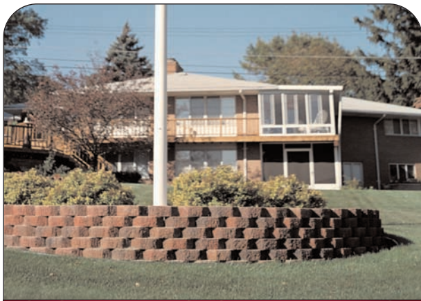
Garden Borders or Planters