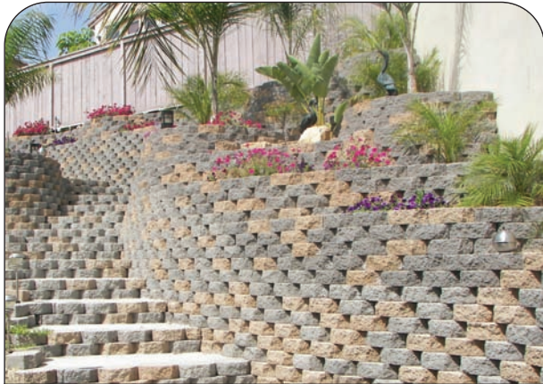
Retaining or Terrace Walls