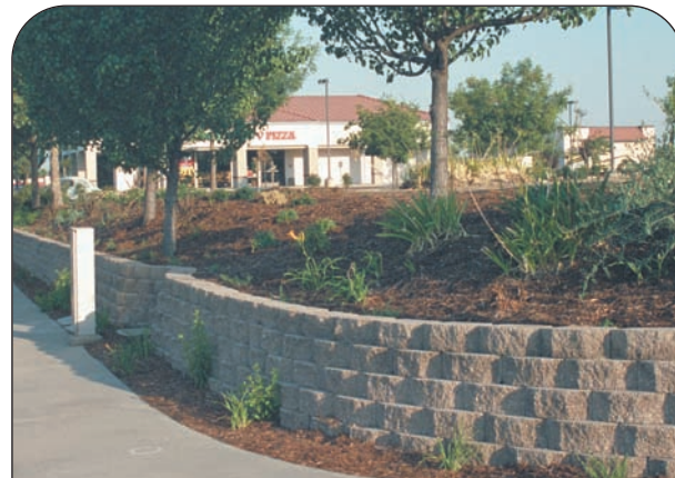
Small Commercial Walls