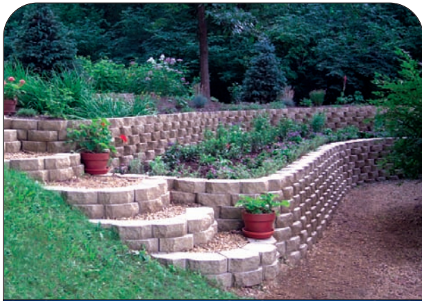
Straight or Curved Walls