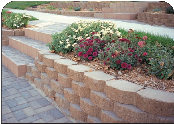
Flower Beds or Planters