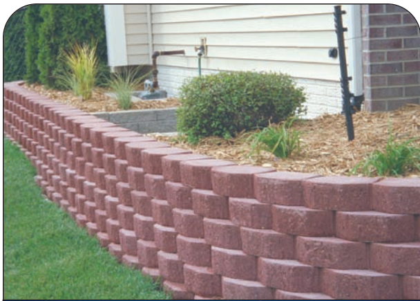
Garden Borders or Tree Rings