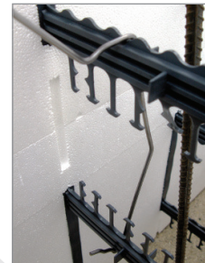
Vertical Clips in Place