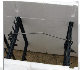
Horizontal Clips in Place

Note: You can skew the HV Clip a notch or two for an even tighter fit, if needed.