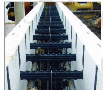
Showing HV Clips holding down a top row that has been cut down to +/- 8" in height

Using the Fox Block HV clip eliminates the need for truss wire completely on your jobs. The result is that for about 1/2 the cost of the truss wire you will get a stronger and straighter job.